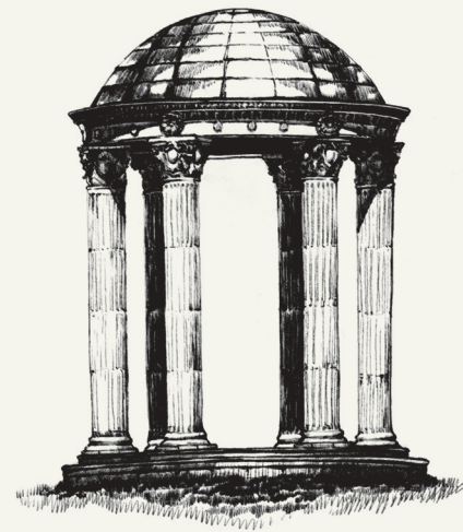
The Rotunda—an alumni gift given as a symbol of thankfulness